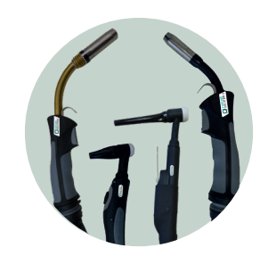
Manufacture of torches all processes