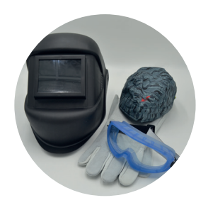
Personal protective equipment